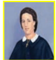
Ven. Henriette Delille 1812-1862

On the side of the church, there is a garden which honors all of the saints that influenced the Evangelization of New Orleans.